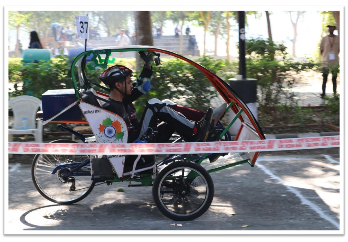
Ranked 2nd in 'Conventional Efficycle Segment'.