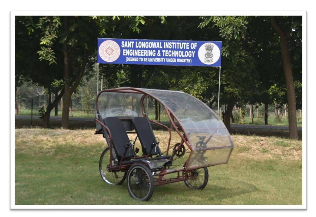
EFFICYCLE 22----'FATEH 7'