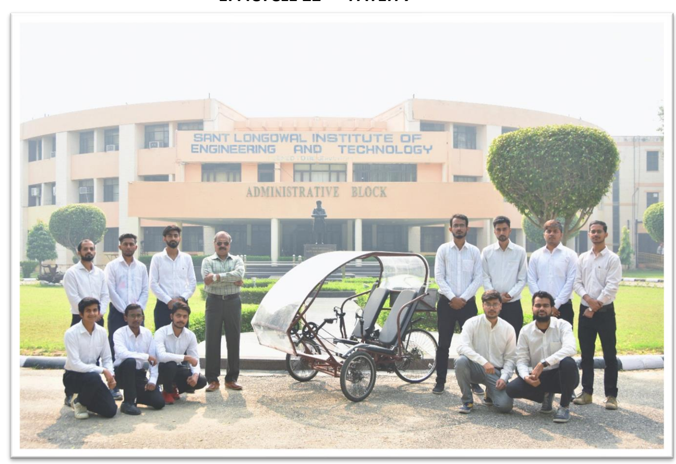
Team - Green Rangers'22