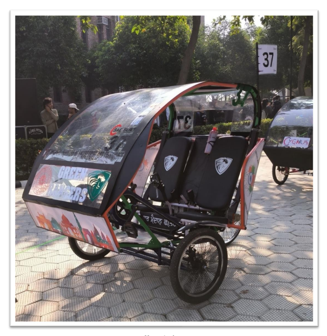
SLIET Efficycle `22 ----#37