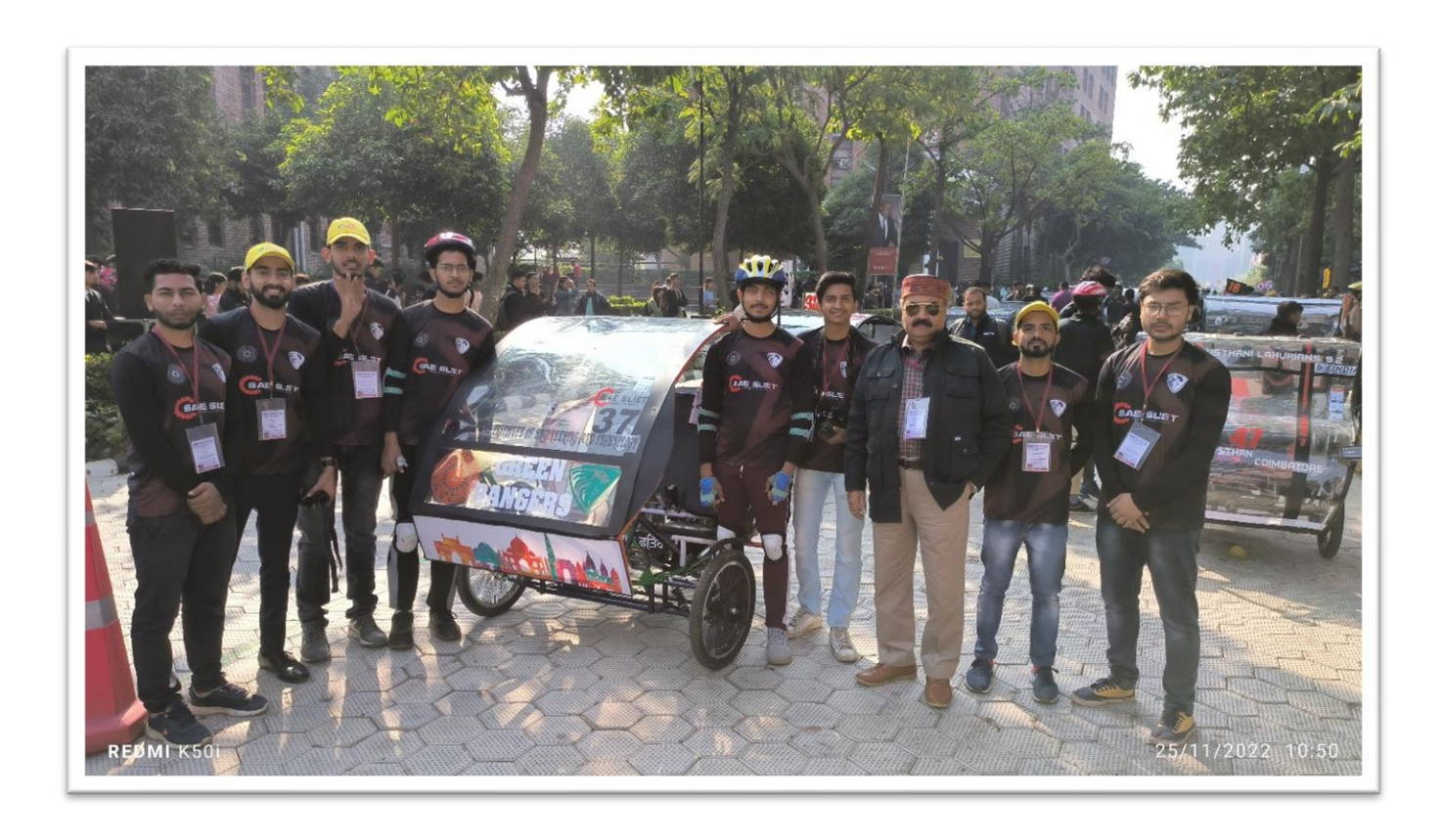
Team - Green Rangers'22 at event site