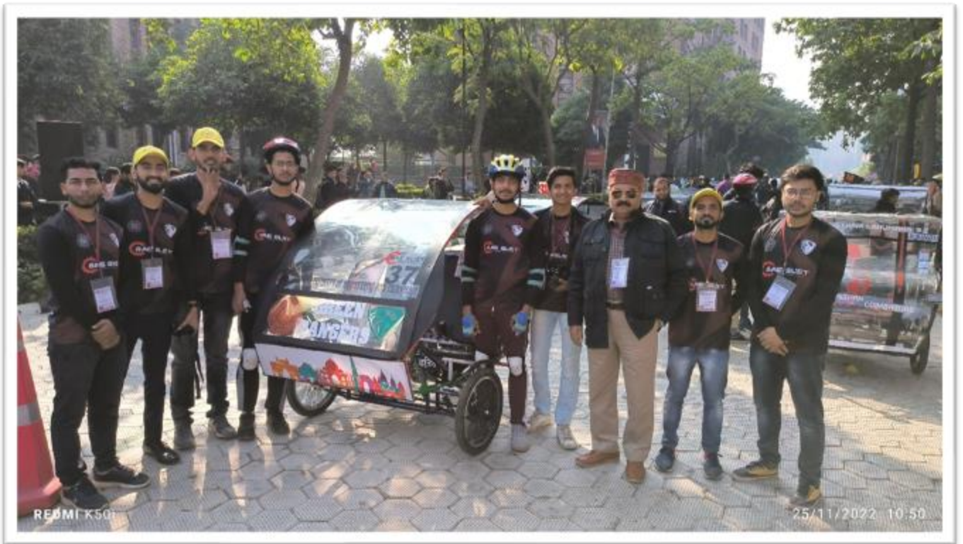
Team - Green Rangers'22 at event site