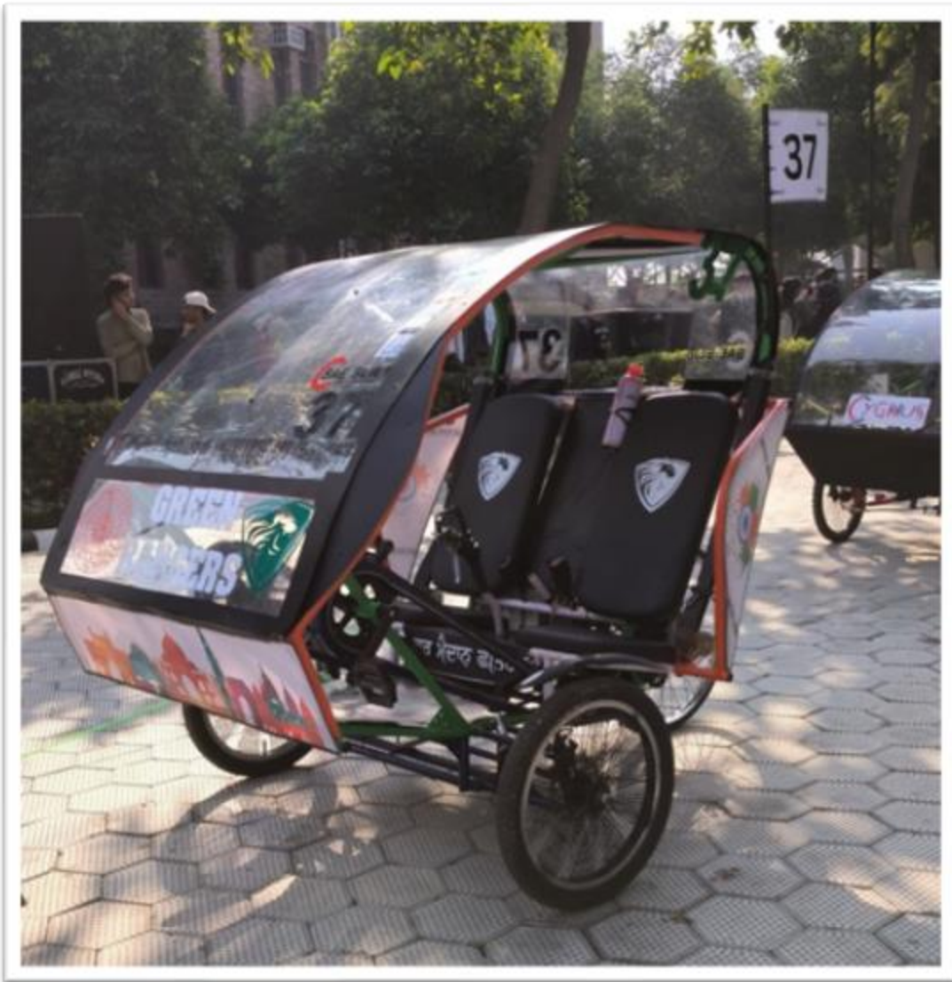
SLIET Efficycle '22 ----#37