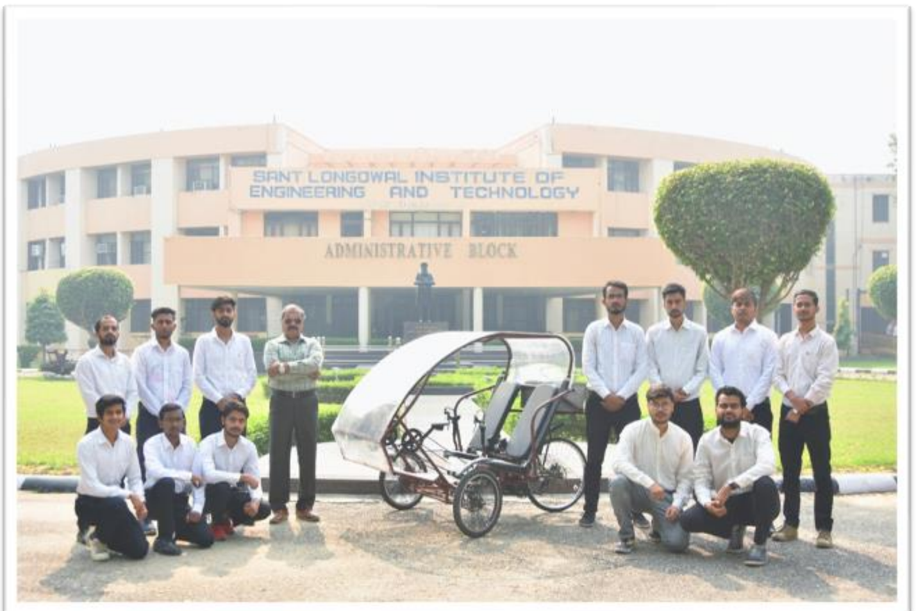
Team - Green Rangers'22