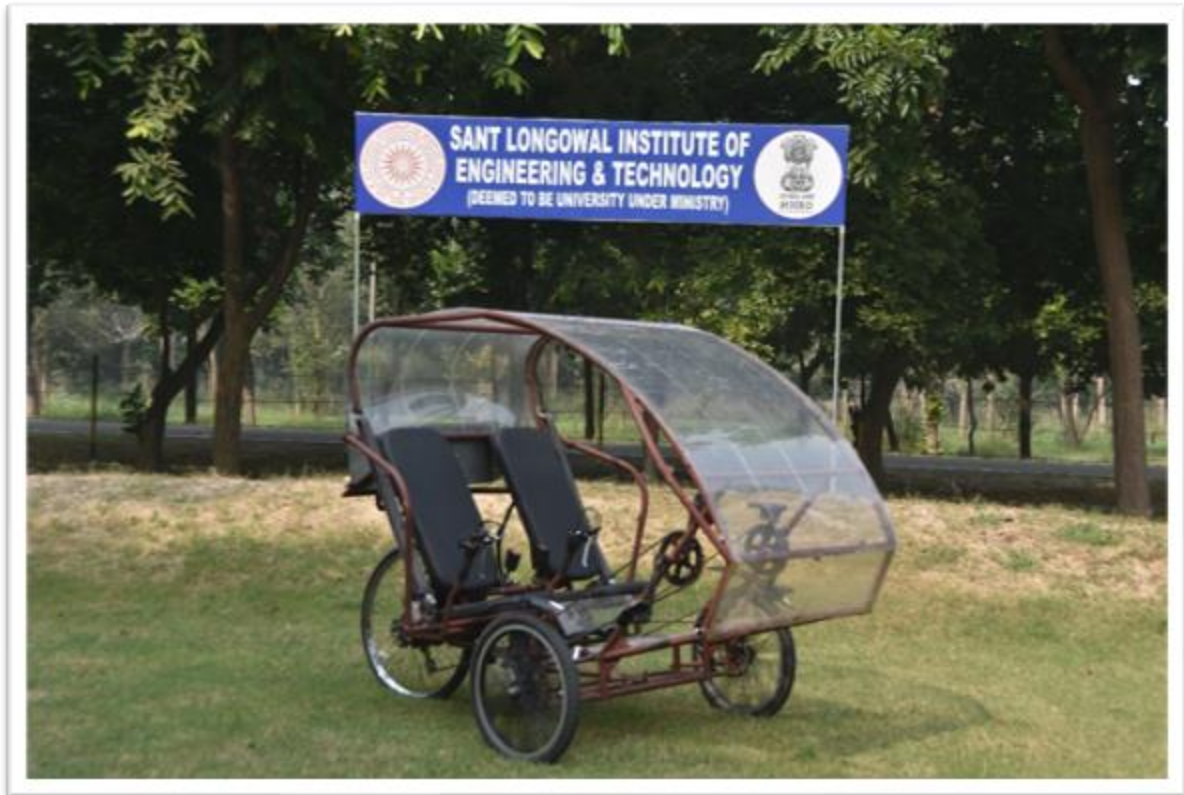
EFFICYCLE 22-----'FATEH 7'