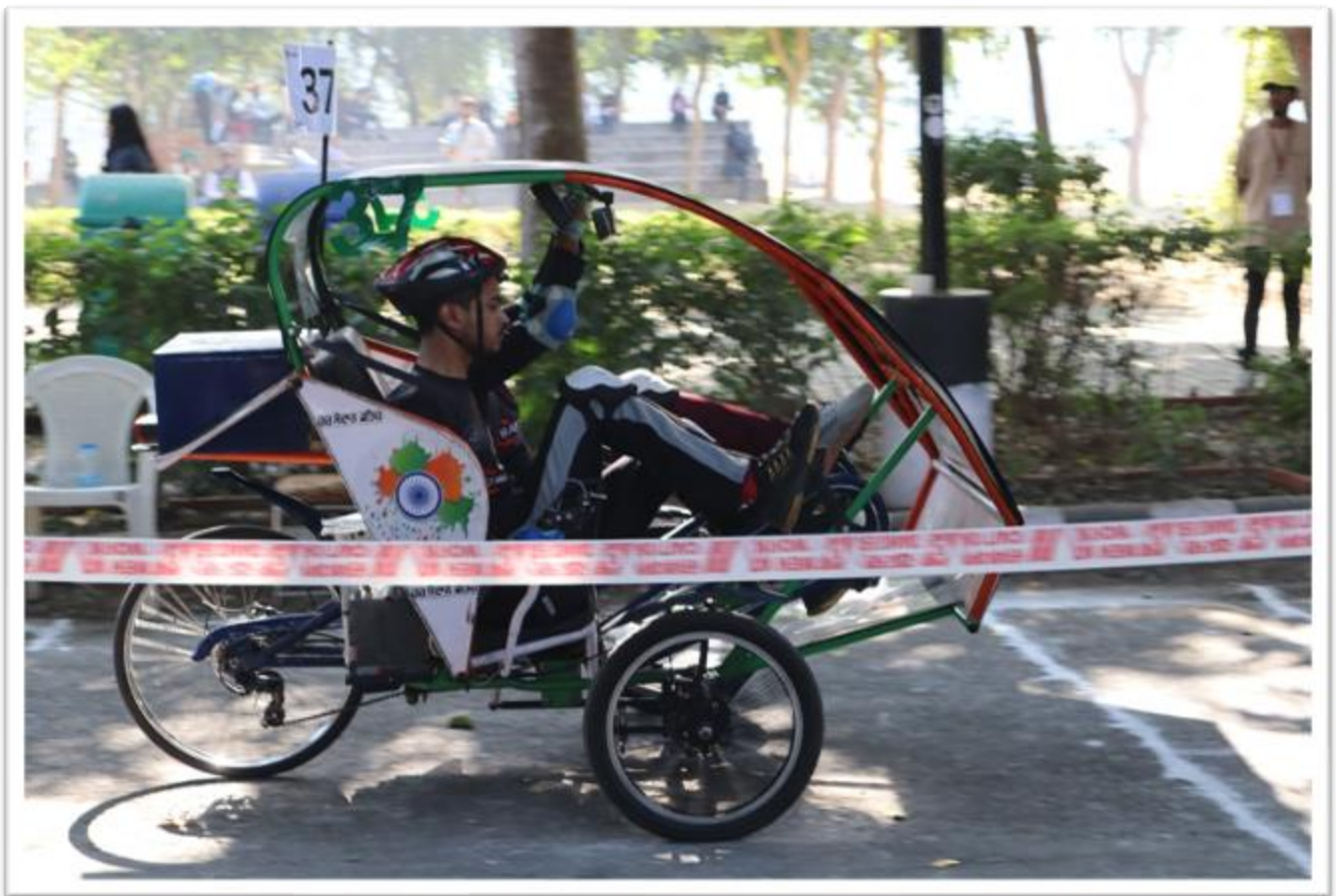
Ranked 5 th in 'Conventional Efficycle Segment'.