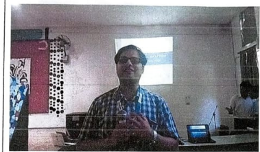
Resource person delivering lecture